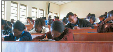
Strathmore students such as these will soon benefit from Strathmore's new membership in IFC's Global Business School Network.