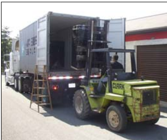
Loading up 16,686 library books. Next stop: Strathmore, Nairobi!

A total of 16,686 books, boxed and shrink-wrapped on eight pallets, are now safely sailing to Nairobi in a 20 foot container.