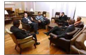
Executives from government and the private sector take a break during Strathmore's Combating Fraud Seminar in Nairobi.