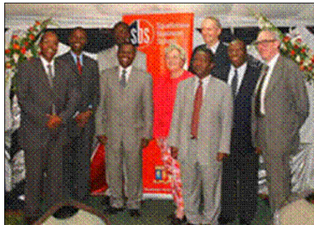
Strathmore University's senior leaders with Baroness Lynda Chalker celebrate Strathmore Business School's AMP Launch.